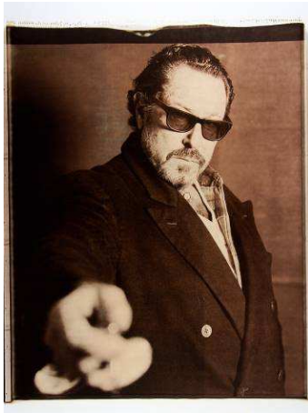
01 Untitled (Self-Portrait), 2008 © Julian Schnabel

Permission is granted for the image material to be used in print media or in temporary online publication. It may only be used in direct connection with coverage of the exhibition JULIAN SCHNABEL »Polaroids« (07.06.–04.08.2018) at OstLicht Gallery. Images may be neither cropped nor retouched. Image files must be removed from the archives after use.