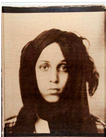
03 Untitled (Olmo), 2008 © Julian Schnabel