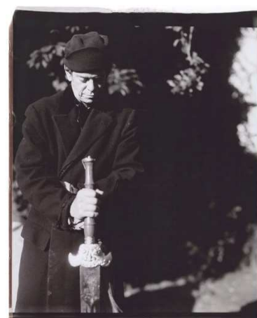
04 Untitled (Lou Reed, Montauk), 2002 © Julian Schnabel