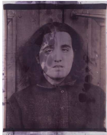
Untitled (Palazzo Chupi, Studio), 2008 © Julian Schnabel